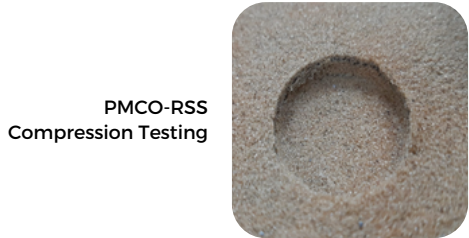
PMCO-RSS Compression Testing

In the Gio Science Lab, Dune Soil Stress Test conducted over a 3-day period, the tested sample exhibited exceptional resistance to pen penetration, reaching a maximum stress of 1000Psi/6.9MPa at 50mm, as indicated by Graph (a). In contrast, the control dune soil test showed a peak stress of 92Psi/0.64MPa at the same 50mm penetration depth.